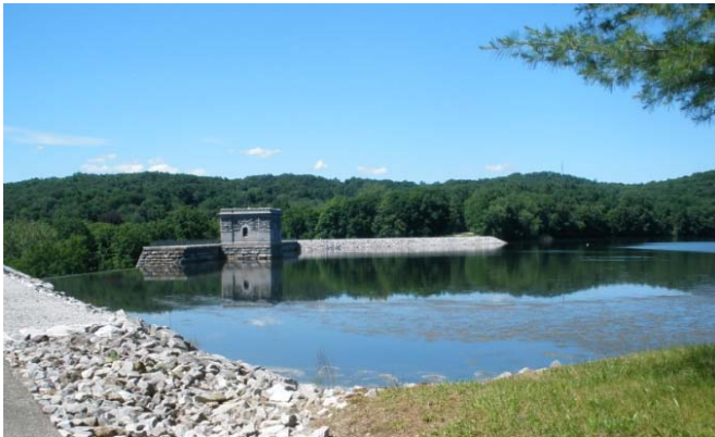
Titicus Reservoir Dam, North Salem, NY