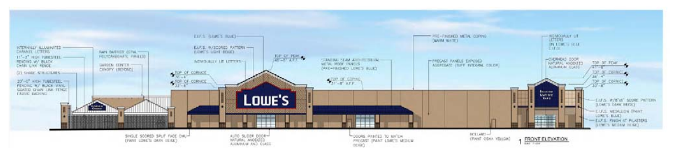
Front Façade Rendering