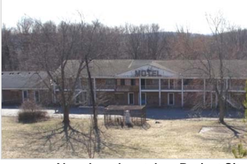
Abandoned motel on Project Site

In June 2016 a revised site plan was proposed for Project Site with Lowe's Home the а Improvement Center replacing Costco. F&A prepared a new retail market analysis and commercial character assessment to examine potential economic and fiscal impacts of the proposed project. The goal was to ascertain whether this project would create any new potentially significant adverse land use, zoning or community character impacts on nearby retail hamlets. The amended site plan was approved the Planning Board in late 2016.