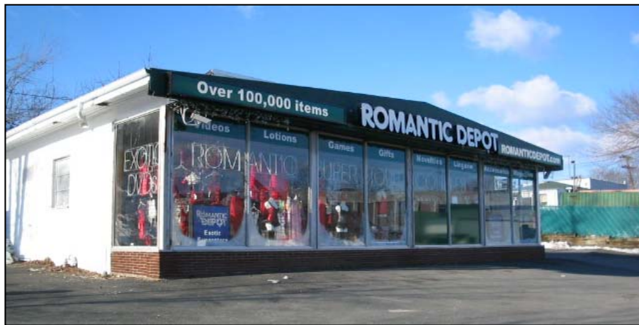
Existing Adult Use on I-287 Eastbound Ramp Elmsford, New York

F&A was retained by the Village of Elmsford to prepare an ordinance aimed at regulating the location of adult-oriented businesses in the Village. In addition, F&A prepared a secondary effects study and a planning analysis to determine the potential impact of adopting the proposed legislation, which was ultimately approved by the Village Board of Trustees. F&A continues to advise the Village on adult entertainment-related zoning and land use issues.