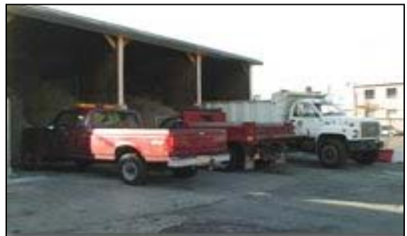
Existing Fort Lee DPW Yard New Jersey