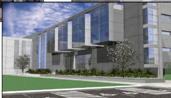
Touro Law School Central Islip, New York