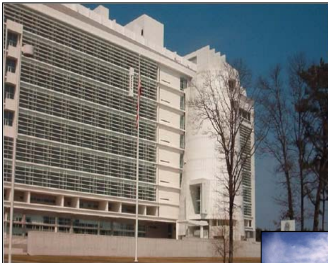
Alfonse D'Amato Federal Courthouse Central Islip, New York

The firm completed an assessment of County court needs in Suffolk and recommended, based upon analyses involving traffic, parking space needs and economic impact, the optimal location for 18 additional courtrooms in Riverhead and Central Islip. F&A headed a team of management consultants, a retired New York State Supreme Court justice and architects experienced in courthouse design. The report served as the basis for the County adopting a budget to proceed with construction in these locations. Court facilities, along with a branch of Touro Law School, have been constructed in Central Islip. Planning is underway in Riverhead.