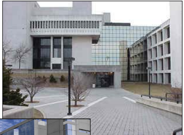
Suffolk County Supreme Courthouse Riverhead, New York