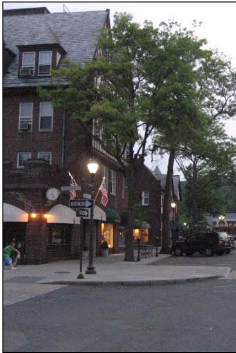
Village Center in downtown Scarsdale New York

F&A was retained by the Town/Village of Scarsdale to develop a Downtown Infrastructure Improvement Plan to create better parking conditions, traffic circulation and pedestrian safety, as well as a more aesthetically pleasing environment as a result of new zoning, streetscape and design guidelines that were ultimately implemented. As part of the Plan , F&A conducted extensive community outreach and crafted a strategic partnership approach with a downtown committee to enhance the economic viability of the CBD and identify retail market niches for the Village to pursue. A $5 million capital improvement program, based upon the Infrastructure Improvement Plan , and reflecting the firm's recommendations, was implemented by the Village. In addition, F&A assisted in creating a Special Tax Assessment District to help finance the recommended improvements.