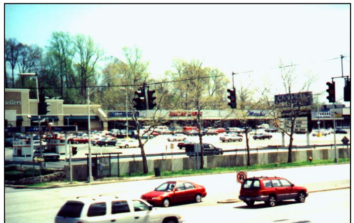
Existing strip retail along Central Park Avenue Yonkers, New York