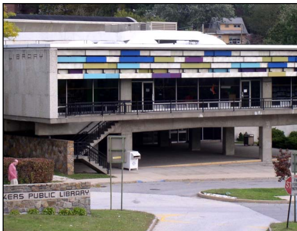
Grinton I. Will Public Library Central Park Avenue, Yonkers, New York