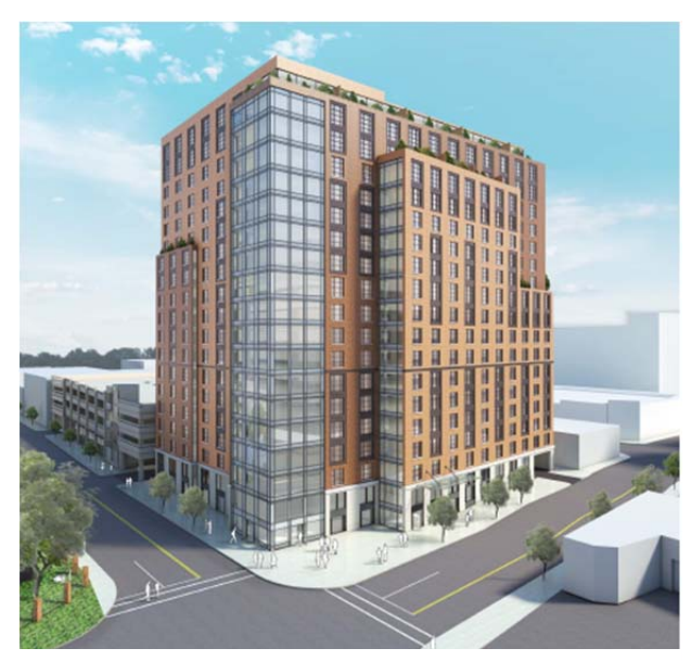
Conceptual rendering of proposed 42 West Broad development

F&A reviewed a Long-form EAF and Addenda under SEQR, on behalf of the City Council, for Special Permit and Site Plan Approvals for the 42 West Broad mixed use project in the Fleetwood business district. The project consisted of an 18-story. 268,750 square foot mixed-use market-rate residential (249 units) and retail (12,330± SF) building and the renovation of an existing 4-story onsite parking garage reconfigured to accommodate up to 533 spaces. The project was approved by the City Council via a Negative Declaration and subsequently challenged in court via an Article 78 proceeding. F&A served as expert witness on the Citv's behalf