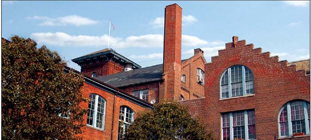
Knickerbocker Lofts New Rochelle, New York

F&A was retained by this developer/investor group to conduct a market feasibility study for market rate, rental loft housing in the City of New Rochelle. The study included a demographic analysis, an examination of comparables in the primary, secondary, and tertiary markets and a supply and demand analysis for housing in general, and specifically a 46 unit, adaptive re-use loft housing development known as Knickerbocker Lofts. The project was approved and is in occupancy. It has since been converted into condominiums.