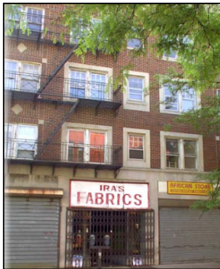
125 S. Fourth Avenue (before) Mount Vernon, New York