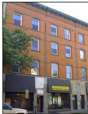
127-131 S. Fourth Avenue (before) Mount Vernon, NY