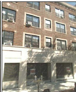
125 S. Fourth Avenue (completed) Mount Vernon, New York