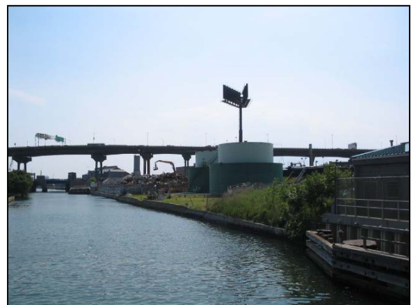
Existing views from the Gowanus Canal, Brooklyn, New York