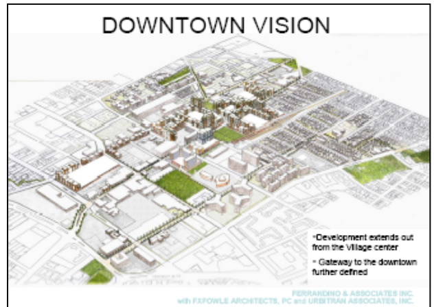
Proposed Downtown Vision Map Village of Hempstead, New York

F&A was retained by the Community Development Agency to prepare an update to the Comprehensive Plan, including a focus on the Village's downtown. This action-oriented, stakeholder-driven plan included extensive community visioning, land use, zoning and urban design components, such as streetscape and adaptive reuse of vacant and under-utilized buildings, and issues associated with vehicular and pedestrian circulation and parking for the largest village (population 60,000) in Nassau County. Long-term components of the Downtown Plan include a capital improvements program and a market study that will assist the Village in conducting business recruitment efforts.