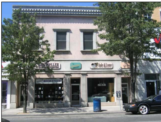
Existing Downtown storefronts on Main Street Village of Hempstead, New York