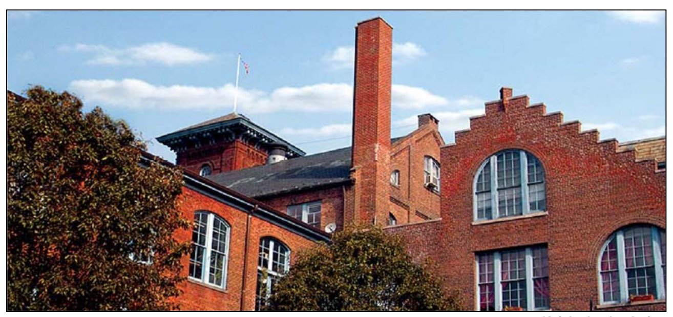
Knickerbocker Lofts New Rochelle, New York

F&A was retained by this developer/investor group to conduct a market feasibility study for market rate, rental loft housing in the City of New Rochelle. The study included a demographic analysis, an examination of comparables in the primary, secondary, and tertiary markets and a supply and demand analysis for housing in general, and specifically a 46 unit, adaptive re-use loft housing development known as Knickerbocker Lofts. The project was approved and is in occupancy. It has since been converted into condominiums.